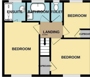
1ST FLOOR 418 sq.ft. (38.8 sq.m.) approx.